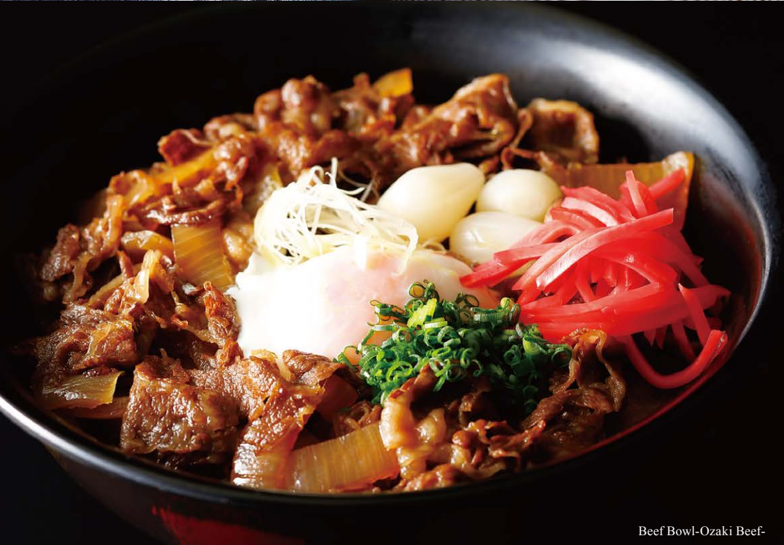
Beef Bowl-Ozaki Beef