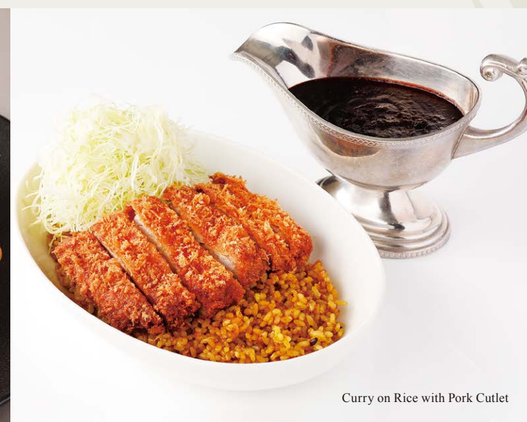
Curry on Rice with Pork Cutlet