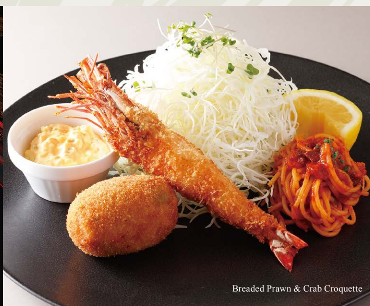
Breaded Prawn & Crab Croquette