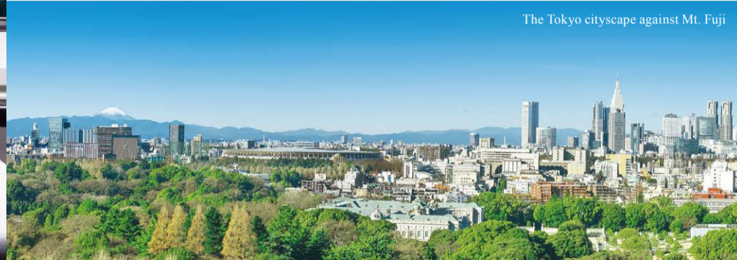
The Tokyo cityscape against Mt. Fuji

The two buffet restaurants at Hotel New Otani Tokyo are both located on high floors and afford breathtaking views. Mt. Fuji is visible on clear days, with the greenery of the State Guest House and the Gaien area presenting a soothing vista by day, and the Tokyo nightscape glittering after dusk. The symbolic Tokyo Skytree can be seen from VIEW & DINING THE SKY.