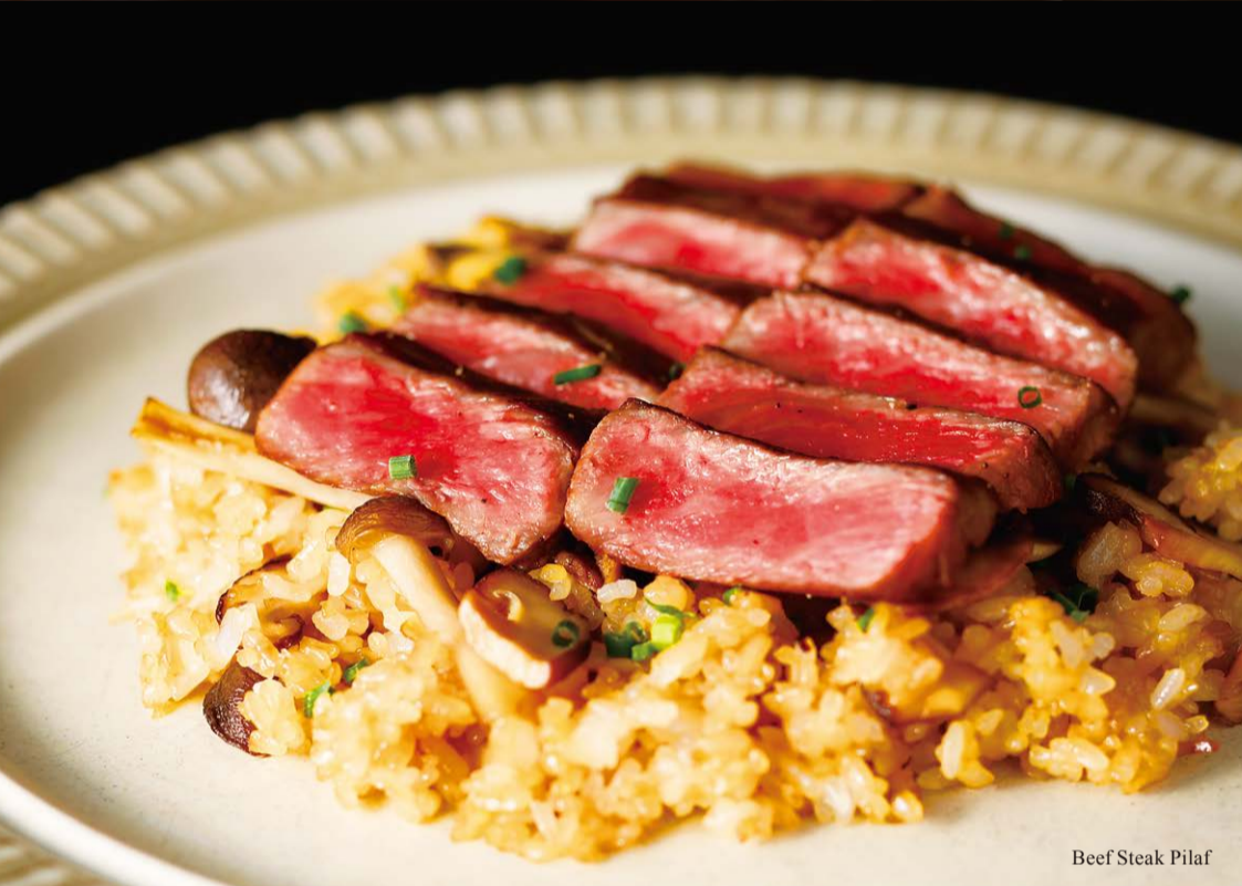
Beef Steak Pilaf