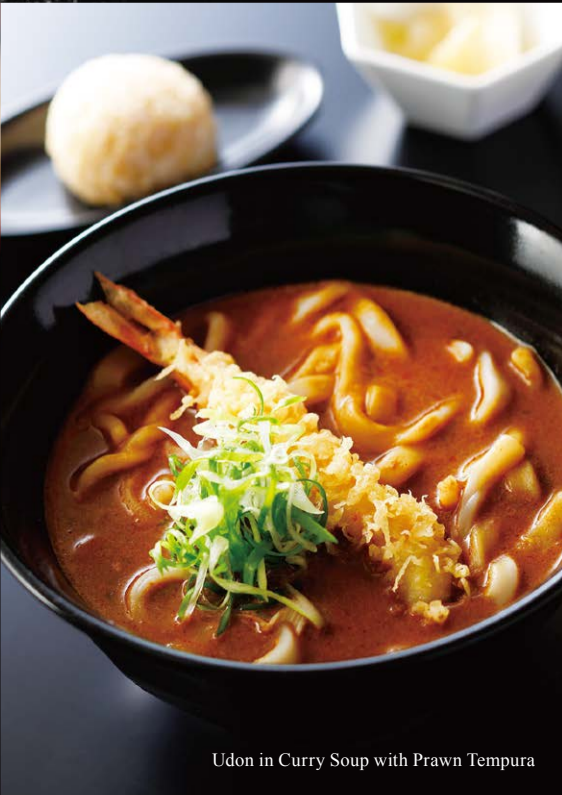
Udon in Curry Soup with Prawn Tempura