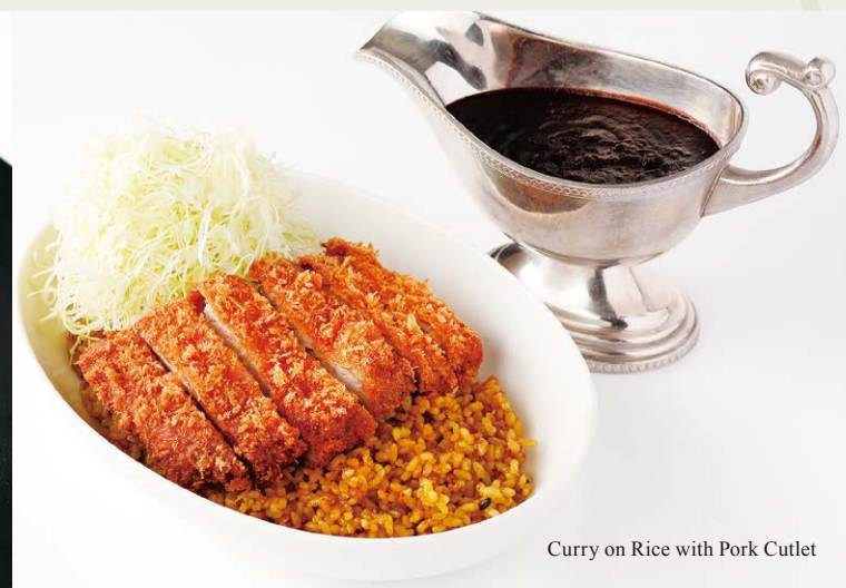
Curry on Rice with Pork Cutlet