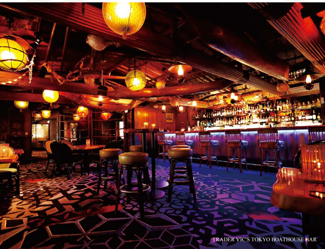
TRADER VIC'S TOKYO BOATHOUSE BAR